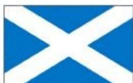
St. Andrew's Cross _____