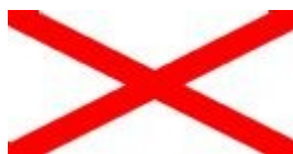
St. Patrick's Cross _____