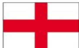
St. George's Cross _____

9. The British flag, called the Union Jack is made up of the individual flags of three countries in the UK. Write their names. Colour the final flag.